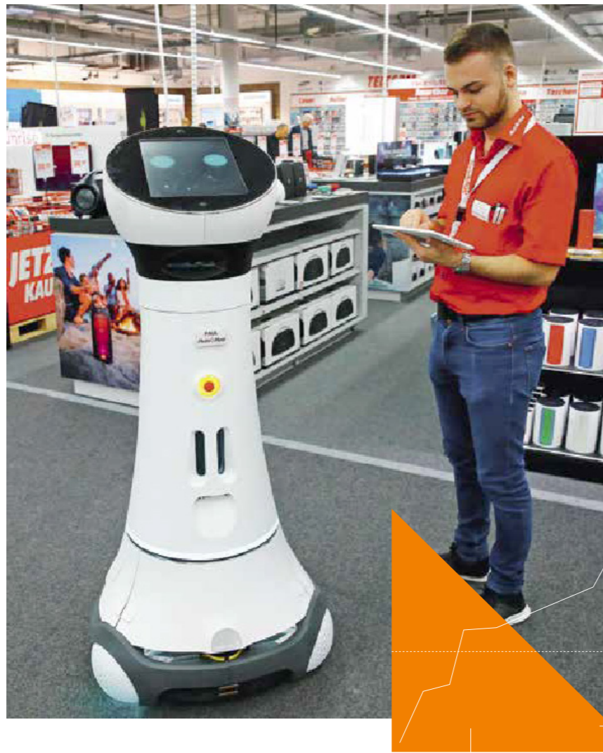
At the fourth stage of digital evolution, humans work side by side with intelligent machines – as in this electronics store, where robots reduce the workload for salespeople.

5. Fully integrated digital organization. Organizations that practice digitization at every level occupy the top step of the evolutionary ladder. All things digital have become fixed elements in the company's DNA. While top management lays out a strategy and ensures needed resources are in place, cross-functional teams apply agile methods to further develop products and processes. Many activities are automated, and artificial intelligence and the Internet of Things play a role. Expert teams are set up according to data-based competence analyses and work together for limited periods on joint tasks. The flexible allocation of work capacity to projects is standard procedure, as is regular sharing of data, methods, and tools.